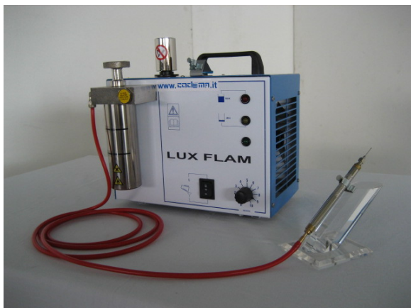
Can be used with Micro Torch