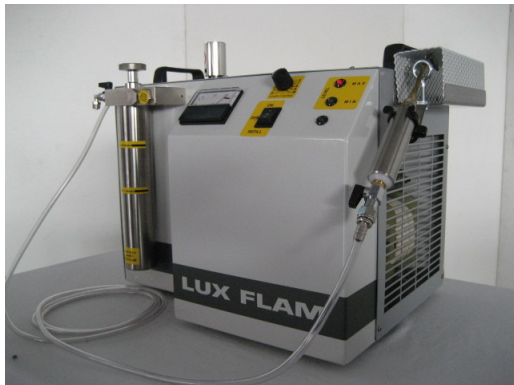
Can be used with Big – Medium and Micro Torch